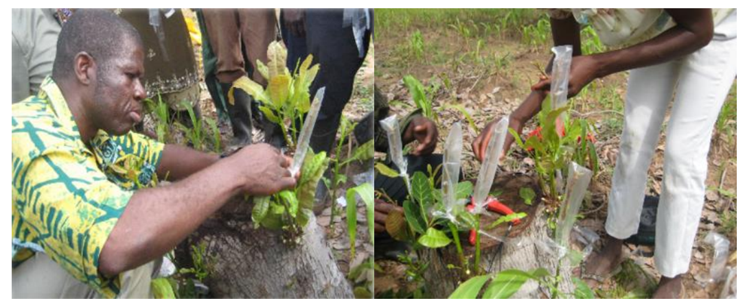
Grafting scion on shoots for canopy substitution

Practical Exercise: Select and graft a scion on the selected shoots for canopy substitution. Make sure that you use the appropriate tools an follow the grafting procedure meticulously.