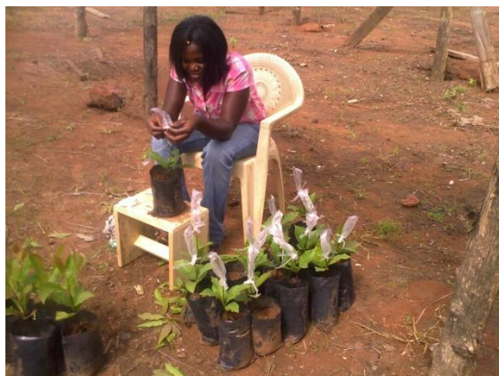
Woman grafting high-quality seedlings

Secondly, women have been trained in grafting and nursery management and have learnt how to grow good quality cashew seedlings which they can use on their farms to increase yields. After the initial training, nursery groups have been established. Like in beekeeping, selling the seedlings provides an additional income source for the individual and the group helping to upscale their activities. Furthermore, being a member of a grafting (or beekeeping) group brings women (and men) together and offers a space where they can gain knowledge, freely share their opinions and speak out. This opportunity is not provided in community meetings or other traditionally male-dominated groups and gatherings.