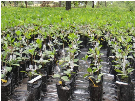
Cashew seedlings in the Cocoa Research Institute in Ghana (CRIG) in Bole, Brong Ahafo Region

Although the tree material existing in the West African cashew plantations is resistant to draughts and other regional typical environmental factors its productivity can and has to be further improved to achieve higher yields and better quality.