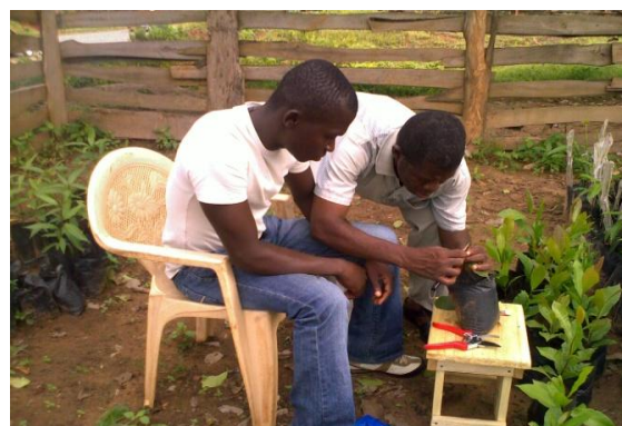
Part three of training for grafters: hands-on-training with support from CRIG.

The 215 trainee grafters, 60 of them women were drawn from Farmer Based Organizations (FBOs) in the project districts with each FBO providing ten grafters. Three trainees are undertaken further training in nursery management to enable them manage the future activities. The trained grafters will further benefit from future ACi training programs such as top-working (grafting on unproductive trees), thinning, pruning, and pest and disease control. This will enable them to further increase their income by providing services to the farmers for a fee.