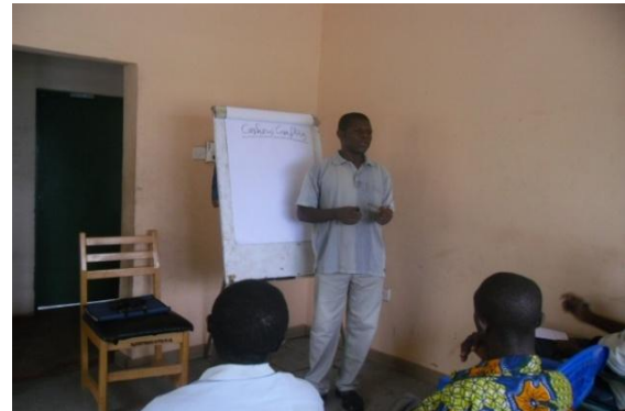
Part one of training for grafters: Theory

Grafting is a horticultural technique whereby branches from one plant are inserted into those of another so that the two sets tissues may join together. The technique is most commonly used in propagation of commercially grown plants for the horticultural and agricultural trades.