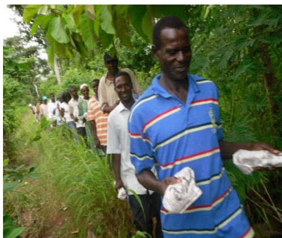
Trainees transporting selected scions from the plantation to the hands-on grafting session.

In 2011, the proposed planting material production program is expected to yield 100,000 good quality grafted seedlings by the 23 ACi-assisted nurseries in 17 project districts in the cashew region of Ghana. The seedlings will be planted to establish 150 hectares farmer-based scion gardens to be used later mainly for rehabilitation and upgrading of the low producing cashew farms. Farmers will also have the opportunity of buying grafted seedlings from these nurseries to plant 700ha of cashew plantation.