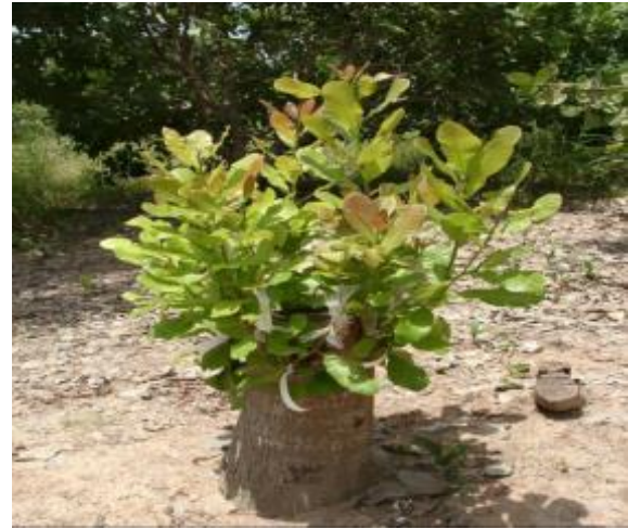
Figure 6 and 5: Removal of cover and development of shoots