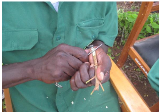
Figure 10: Slicing bottom part of scion for grafting