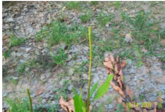
Figure 9: Shoot or sprout split in the centre ready for grafting