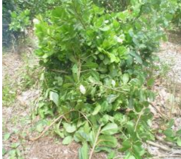
Figure 5: Stump coverage to facilitate initiation of new shoots release