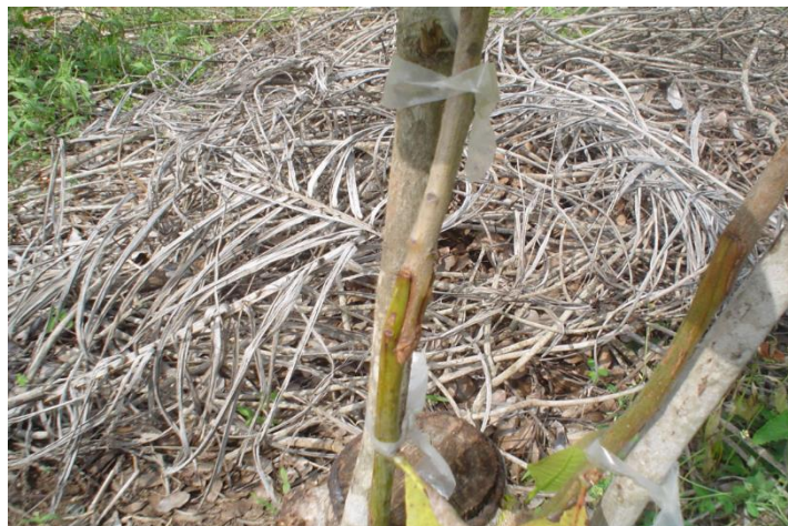
Figure 14: Grafted Shoot Staked