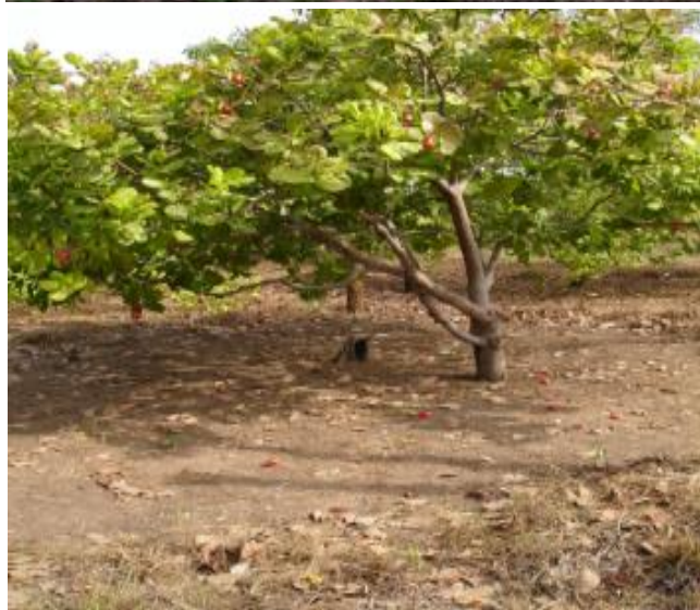
Figure 15: Topworked plants at different stages of development