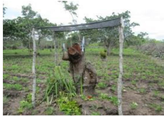
Figure 12 and 13: Shading of the topworked stump with local materials (above) or with black nylon netting (bottom)