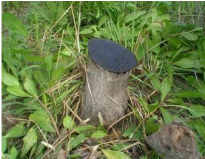
Figure 2: Cut surface painted with coal tar, oil or kerosene mixture + coal powder