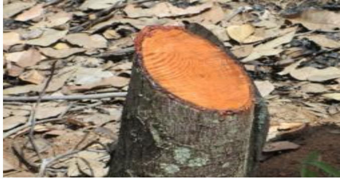
Figure 1: Stumping tree for topworking