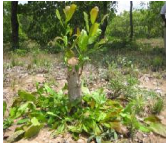
Figure 7 and 8: Erect and cut shoots for grafting

NB: The number of shoots to be grafted will be determined as a function of the area of the stump and the number of germinated shoots