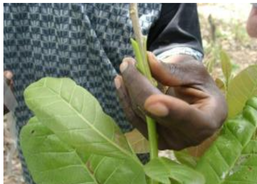
Figure 11: Insertion of the scion into the cleft or split made in the shoot for the grafting