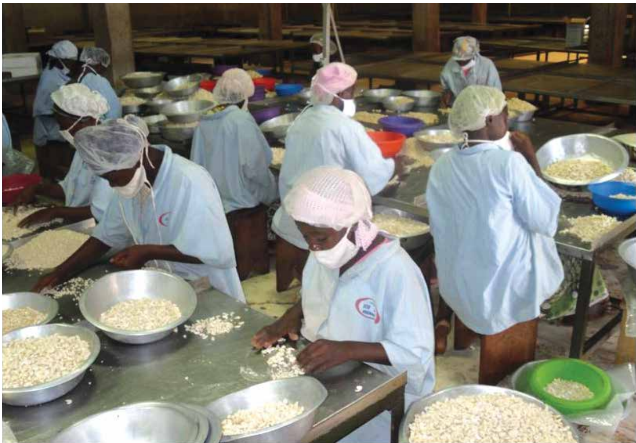
SALLE DE DEPELLICULAGE

Speaking about the nature of her work, she says she has a direct implication in her company’s activities. In other ways, just like the employees, she is at the office from eight in the morning and spends the whole day coordinating the different departments.