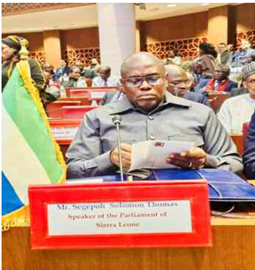
Honorable Speaker of the House of Parliament of Sierra Leone, Hon. Segepoh Solomon Thomas

The initiative of the Atlantic African States, along with the broader African Atlantic collective, focuses on enhancing collaboration among nations along the Atlantic coast. These efforts aim to tackle common challenges, promote sustain-