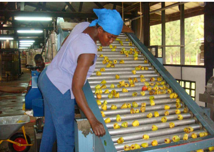
Cashew apple processing