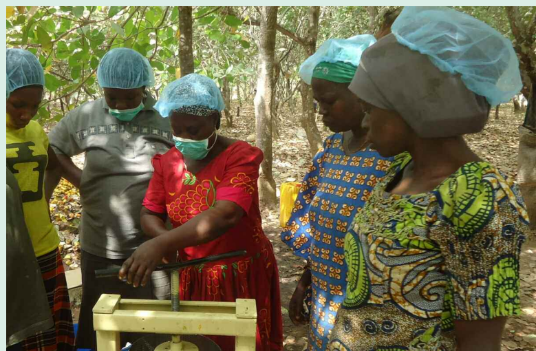
Cashew Apple processing

The country has more than ten (10) operational cashew processing facilities in the country that are in-