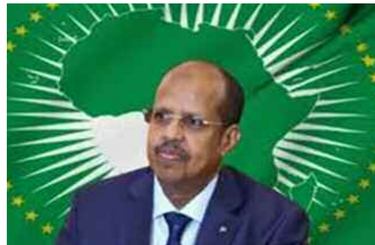
Son Excellence, Mahamoud Ali Youssouf

• Mahmoud Ali Youssouf (Djibouti): 26 votes • Raila Odinga (Kenya): 22 votes