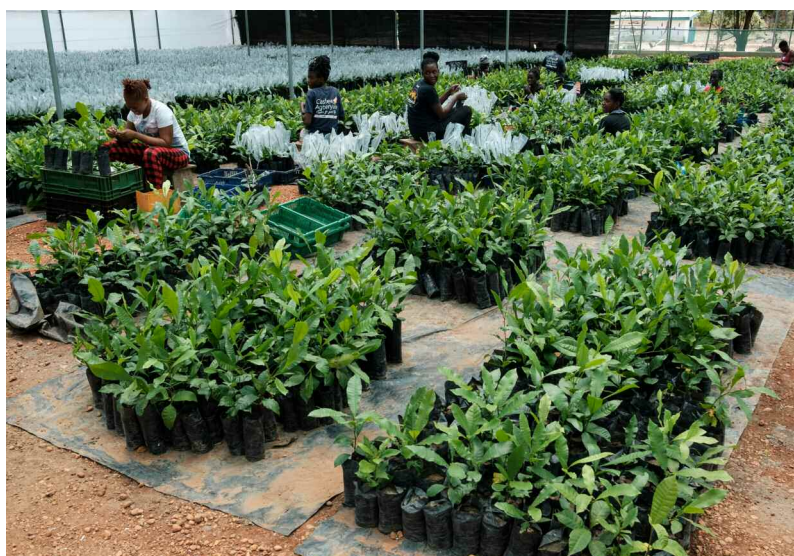
Grafting: young ladies