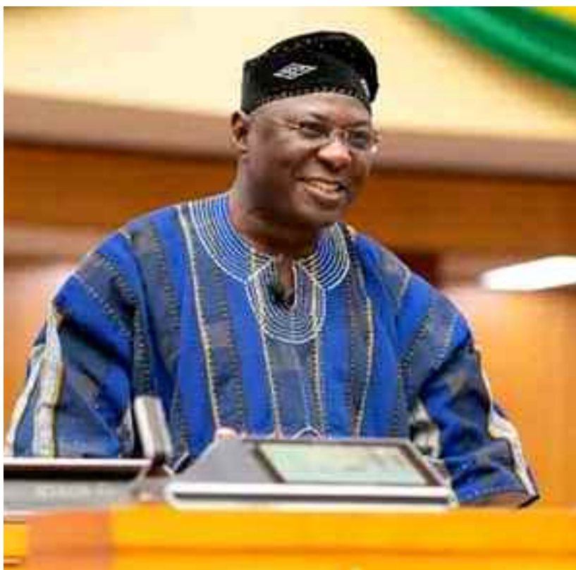
Former Finance Minister, Dr. Mohammed Amin Adam

As the new administration takes over, the debate over Ghana's tax-to-GDP ratio and the pace of its economic reforms is expected to continue. Dr. Amin Adam's call signals the importance of maintaining digital reforms to sustain revenue growth and economic stability.