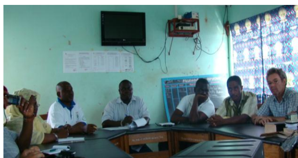
Production of a radio program with experts from ACi in Benin.

Benin made the start and chose 12 local radio stations for cooperation in the beginning of 2010. 24 journalists were invited for training on training contents which ACi offers in its cashew trainings session. Until now over 240 radio programs about the three main modules of farmer training, each with an approximate duration of 25 to 30 minutes, have been broadcasted in French as well as over 12 local languages. ACi is presently kicking-off radio program activities in Burkina Faso and Ghana.