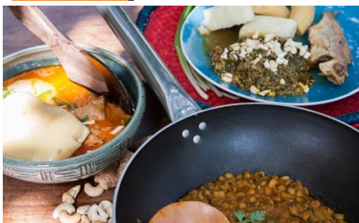
Cashew nut dishes (West African cuisine).