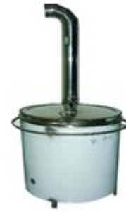
Sample of a pasteurizing machine

The pasteurization rate is 75°C over 5 minutes. This can be done over a stove after clarification or pasteurization machines can be used. When handling the equipment and machinery, it is important to follow the instructions provided in the user manual.